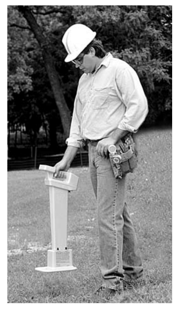
The 3M™ Dynatel™ Cable Locator 2250 can be used with the Dynatel 2205/2206 EMS Marker Locating Accessory.

For cable path locating, the 2250 receiver uses one of four user-selected locating modes – dual peak, dual null, differential or special peak (which increases the sensitivity of the receiver for tracing over longer distances). The mode is selected depending on which is most effective under the locating conditions.