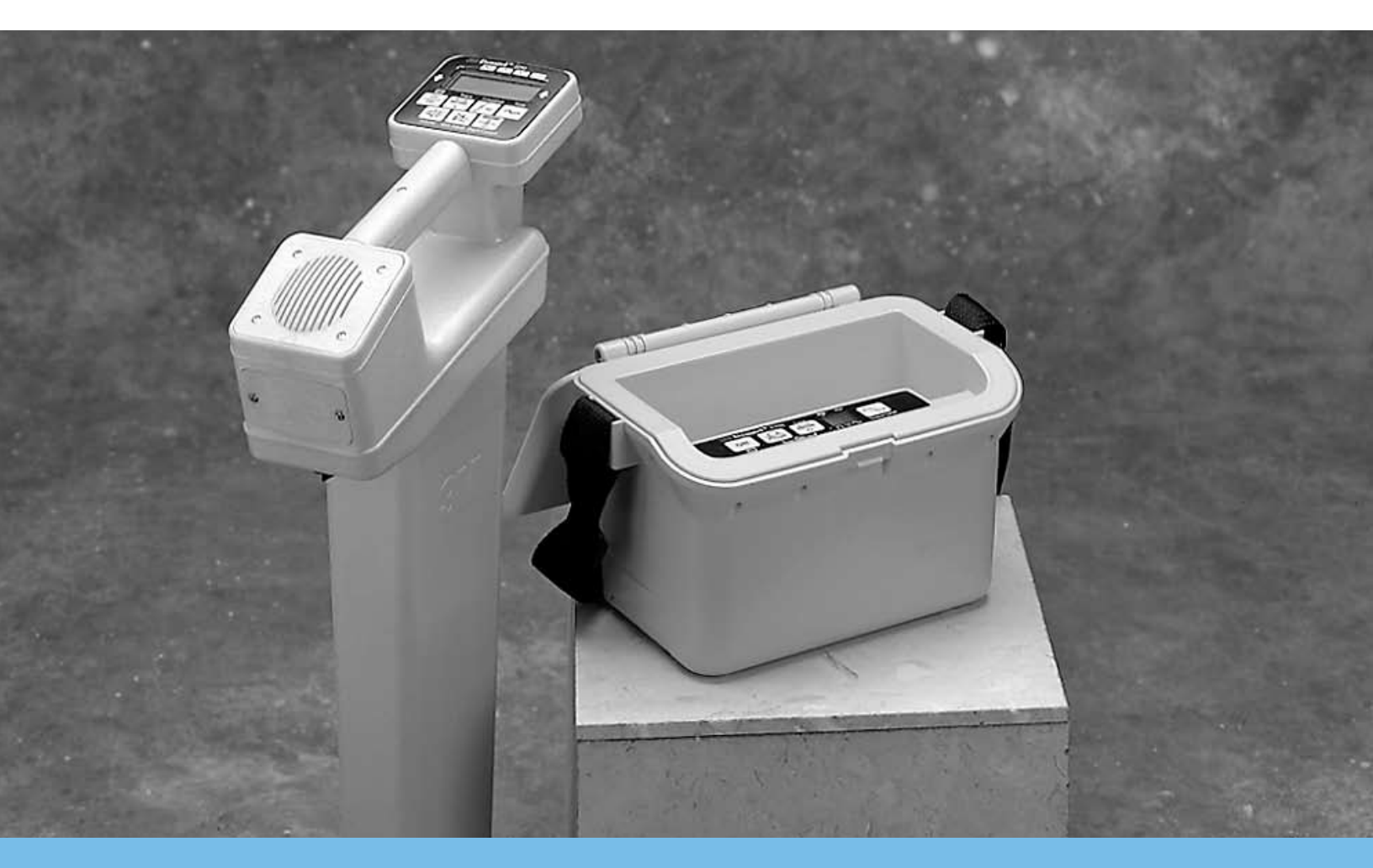
Quickly and Accurately Identify Underground Assets